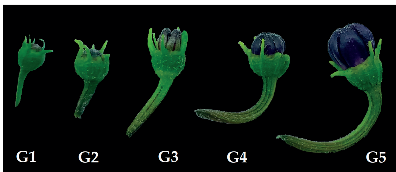
Figure 1. Flower buds of Capsicum pubescens grouped by the longitudinal relationship between sepal and petal.